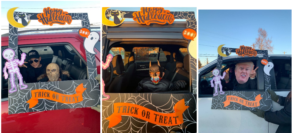
Drive Through Photo Booth at Mt. View

Girdwood: A Gerrish patron took control of the Instagram account iloveanchorage for a week and shared their positive experience with our personal librarian service.