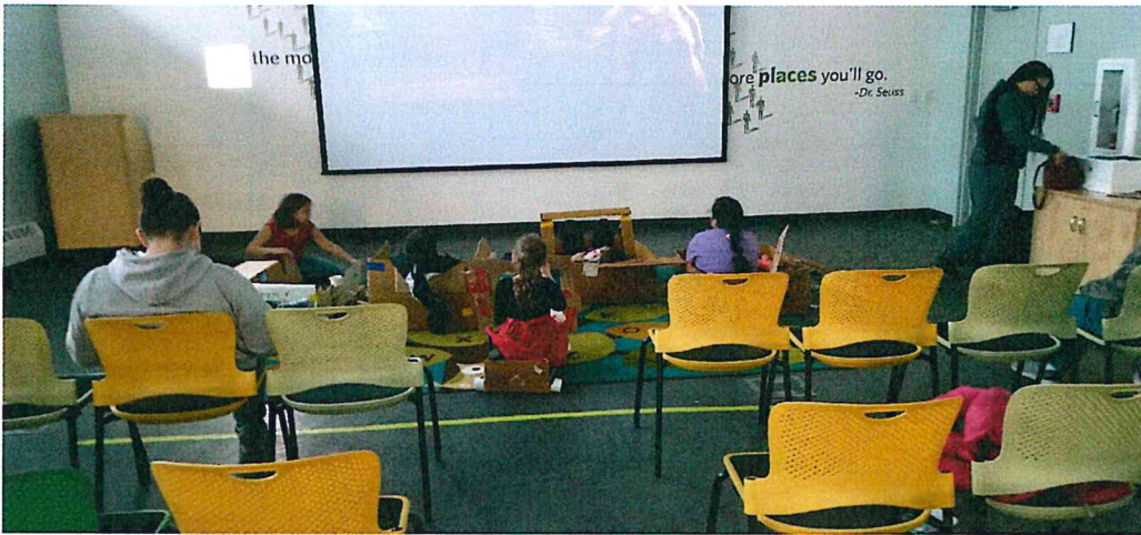
Kids relax in their vehicles while watching a movie at Mt. View