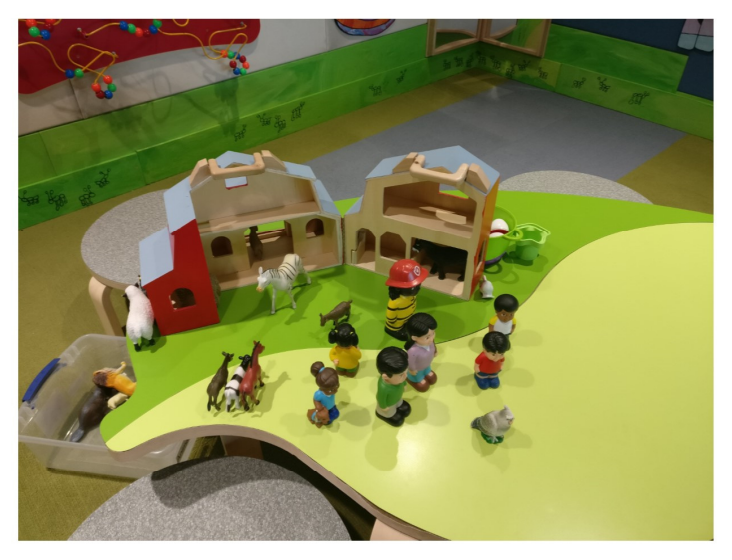
After Storytime, I can play. I can leave the Storytheater when I am ready.

My mom or dad or other grownup stays with me during storytime.