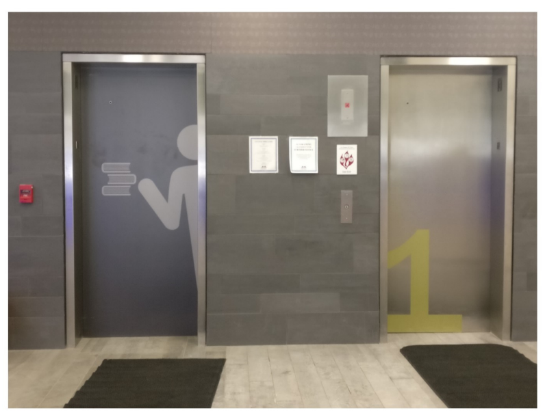
I take the elevator or stairs to the second floor.