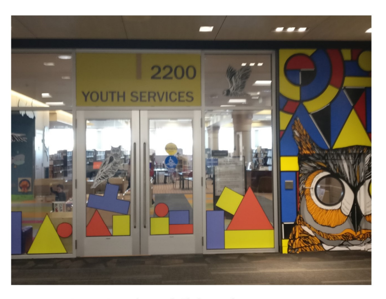
I go to the children's room.