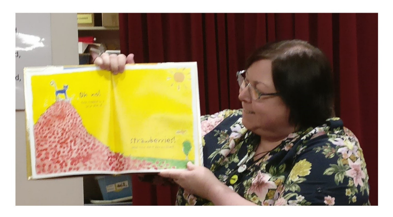
I listen while the librarians read stories.

We sing songs and play. I can sing and play along, or I can just listen.